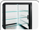
Refrigerated glass shelves