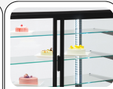
Rear sliding doors in Thermopane glass