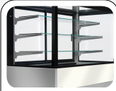
Nightblind (Fabric - Grey color)